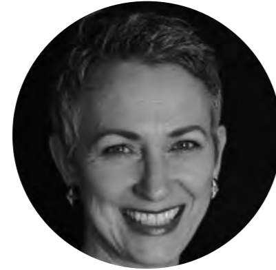
Dame Inga Beale CEO Lloyds of London