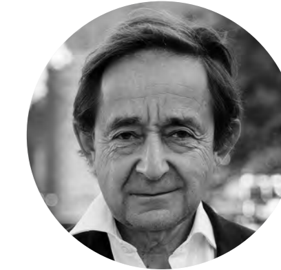
Sir Antony Seldon Head Epsom College